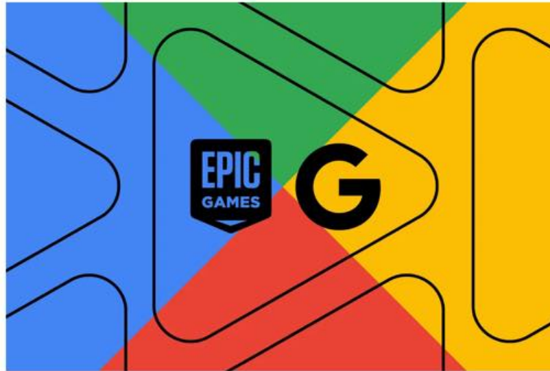
Illustration by Cath Virginia / The Verge

/ The jury decided Google's sweetheart deals were too much.